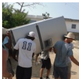
It was not easy