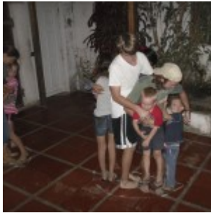
Everybody hop on