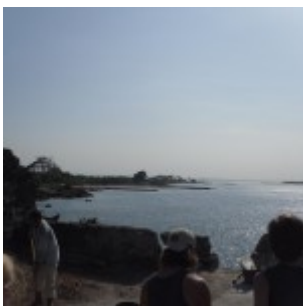
Resort view from the cliffs

We made it to the cliffs. The cliffs are a spot that people can enjoy jumping off and enjoying the thrill of it. We have to go in the mornings though because the fishermen use the area.