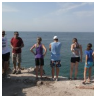
Surveying the cliff