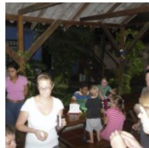
Eating after the games