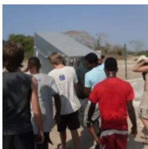
Moving the Ariel's Fridge