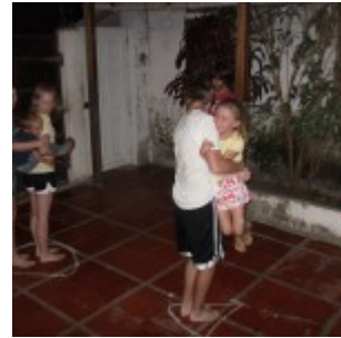
Safe for another round