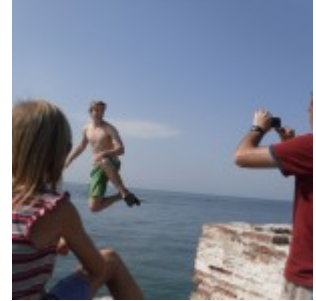
Hey, Hey, Hey

We then headed to the two homes and put the toilets in place in the latrines. We then presented each family with a Bible in Spanish and prayed for them. It was a blessing to see them get the Word and one of the families, in particular, really appreciated it.