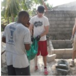
Sifting sand for the concrete