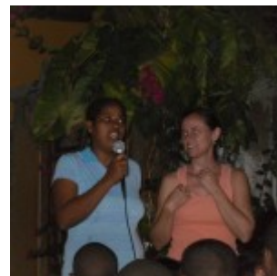
Testimony of healing