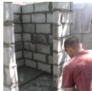
Walls in place

The mission holds a cell group meeting each Thursday. The service starts with a time of