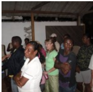
Standing up to say hello