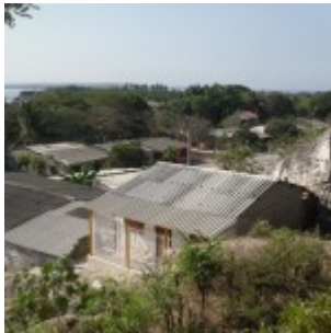
Fort side of Bocachica