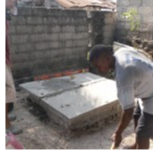
Tops in place