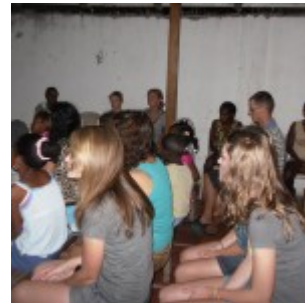
Start of cell group time