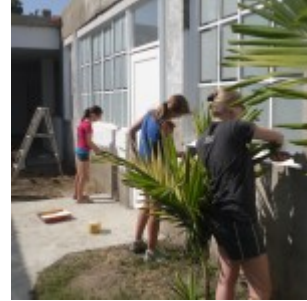
Trimming and painting