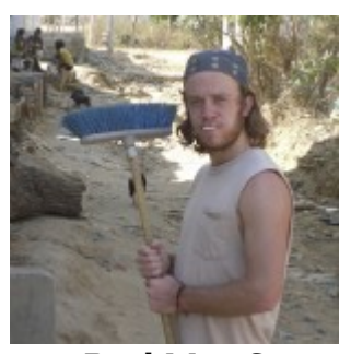
Real Men Sweep