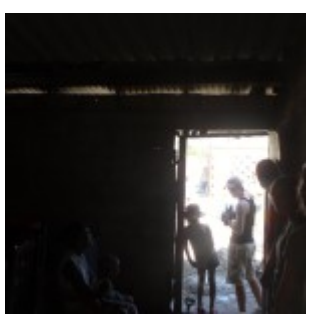
Bucket brigade ready for work