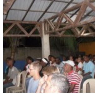
Good crowd for the first night