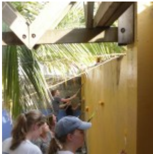
Ladies roll the wall