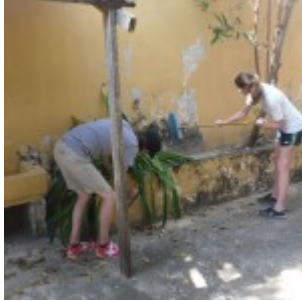
Scraping and brushing