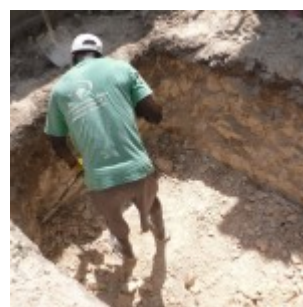
Luis picking the sides

After lunch and a siesta, some people went back to the sites to lay the block walls. The rest of us headed over to Proyecto Libertad's feeding center. The heat and salt air are rough on things and paint is no exception. Our team repainted in 2011 and the walls needed work again. So we scrapped the walls and repainted. We had an audience of little boys who watched with interest and had fun playing with us when we took breaks.