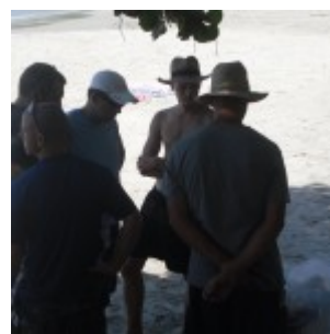
Conversation around the grill