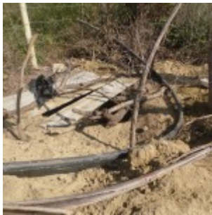
Top of the Ariel's well

Sunday is typically a day of rest and getting used to the climate. In years past, we have gone to a resort that the Colombian's enjoy. This year we decided to do something different. We walked across the island to a beautiful beach. On the way there we stopped by and saw the well the Ariel's had dug (a first for the island, there are two Spanish era wells on the island but no modern ones).