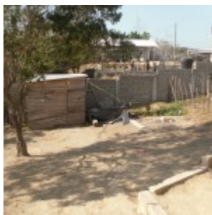
Ariel's back yard

We enjoyed a lunch of grilled chicken and great food. We napped, played and enjoyed the day. We then walked back and took a little tour of the Ariel's house. It is amazing to see what they have done and how the Lord is using it to be a light on the hill. They are a safe place and an inviting place people come to see. They are building relationships and sharing the Gospel with those all around them.