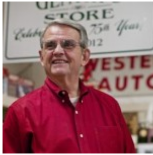
Dad at Gentry's Store's 75th