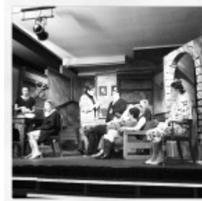
Any Number Can Die