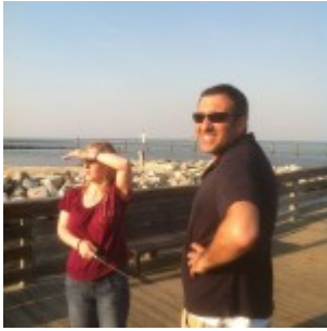
Mancuso's in the sun

year. Those guys lift me up, encourage me and challenge me to go further, thanks guys!