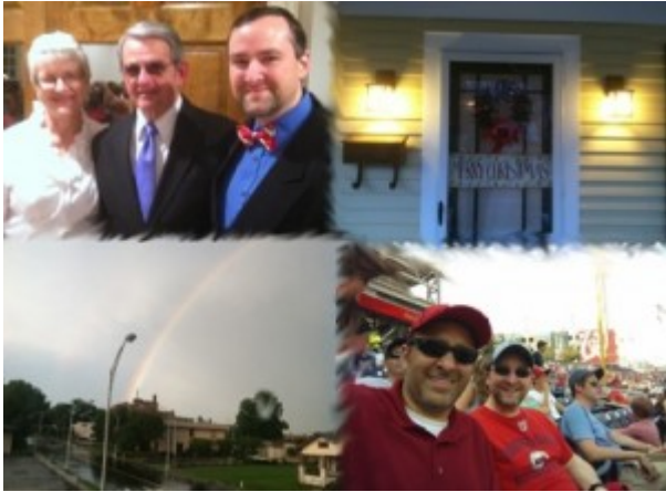
Snapshots from the year

This has been a very full year. It has also been challenging and blessed in many ways. It has been a year of closing doors and opening new ones.