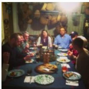
Pizza time with the Gentry's