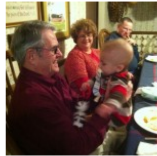
Dad & Chandler