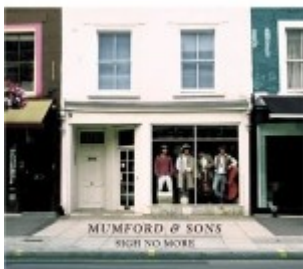
Mumford & Sons

I have a heart for a mission in Colombia. So I’m listening to a little more Christian music in Spanish. I bought Hillsong United’s Live and Unidos Permancemos (sames songs performed in Spanish). I prefer the Spanish language one. Beautiful worship!