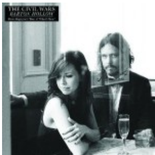
The Civil Wars Barton Hollow