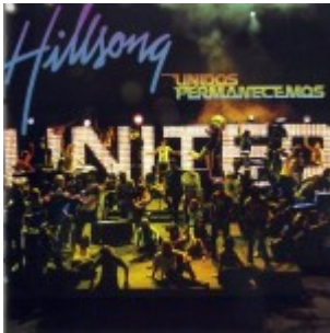
Hillsong United Unidos Permancemos

I have a heart for a mission in Colombia. So I’m listening to a little more Christian music in Spanish. I bought Hillsong United’s Live and Unidos Permancemos (sames songs performed in Spanish). I prefer the Spanish language one. Beautiful worship!