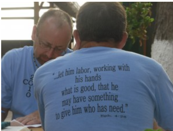
Our theme verse

After breakfast, we sat around the tables and shared. Several of the staff shared thankfulness for our coming. We are grateful to have come and served.