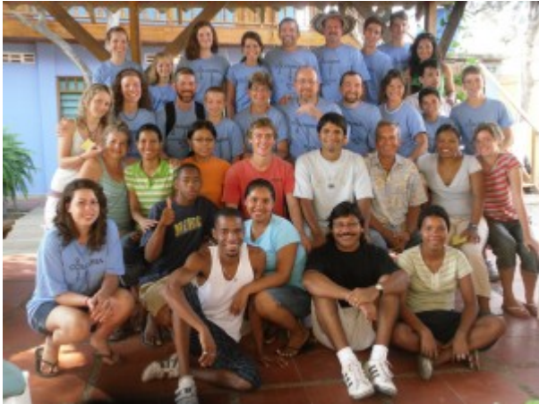
PL Staff & Antioch Team

We headed to the boats and made the trip back to Cartagena.