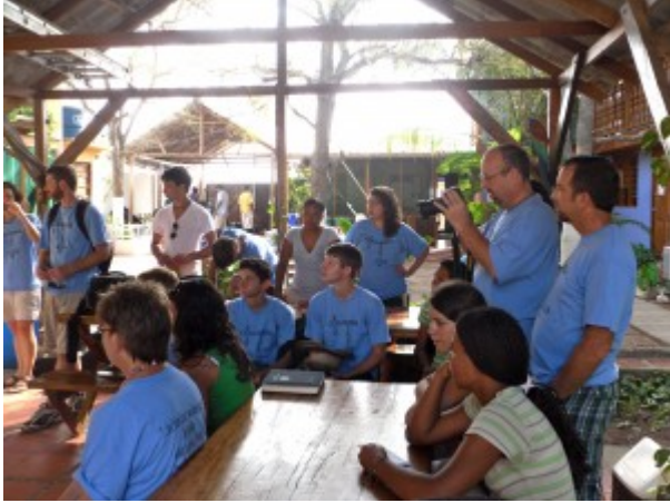
Listening to the stories

It was a morning full of emotions. We were blessed by the Proyecto Libertad Staff. Working with them was just like working with family. The Lord has built the staff there and He is still building. One or two from our team are considering serving there for longer periods of time.