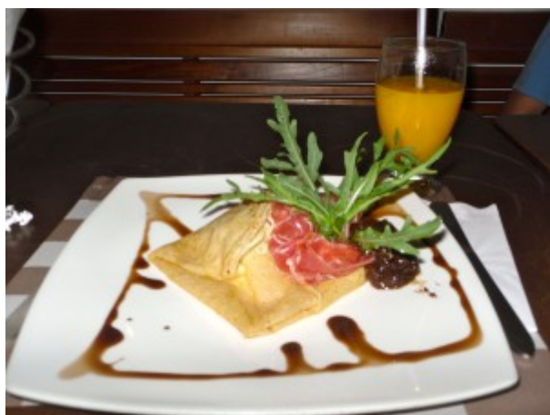
Dinner at Crepes and Waffles

In the afternoon, we all loaded up in taxis and headed into the old town part of the city. We went shopping and enjoyed walking down the streets to Crepes and Waffles. It is a South American chain that has great food. It was an extremely full day and we were blessed.