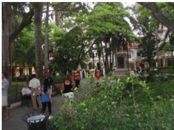
Park in Old Town

In the afternoon, we all loaded up in taxis and headed into the old town part of the city. We went shopping and enjoyed walking down the streets to Crepes and Waffles. It is a South American chain that has great food. It was an extremely full day and we were blessed.